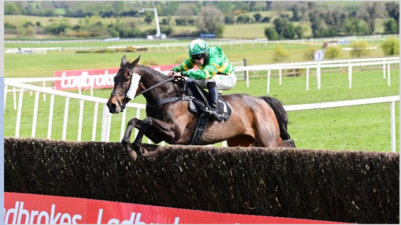
Sully D'Oc AA jumping to his victory at the Punchestown festival in April

This years 5-2-Follow competition will be running from October 1 st – you will find details and an entry form attached. Please get your entries in to Sophie as soon as possible. Last season we were able to donate just under £1,000 to the Somerset and Dorset Air Ambulance, and they're very grateful and appreciative. – best of luck!