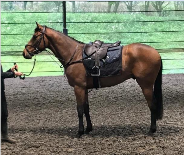
UNNAMED MAHLER x REHILL LASS