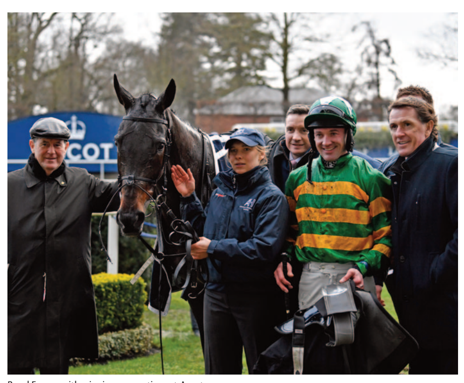
Regal Encore with winning connections at Ascot