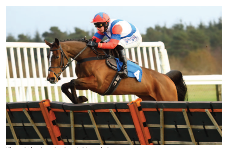
Kilconny Bridge wins easily at Exeter in February for Rex